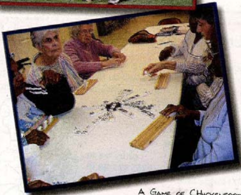
A Game of Chickenfoot